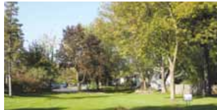
Lot for sale at 4633 Douglas Dr

So far in 2010, nine houses have been completed and sold, four lots have houses under construction, and builders have optioned two other lots. While most of these houses have been built for specific buyers, some may still be available and additional houses may be under construction by