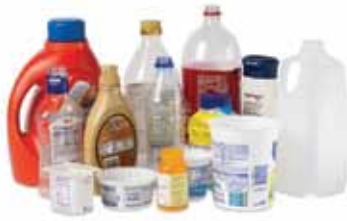
Plastic Bottles and Containers #1-7