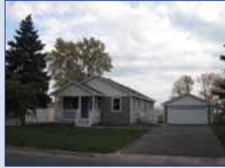
Habitat for Humanity house at 5906 Elmhurst (sold)

For the past few decades, the EDA has been buying blighted, structurally substandard, or functionally obsolete houses from willing sellers, clearing the lots and selling them to builders for construction of new single family houses. So far in 2011: