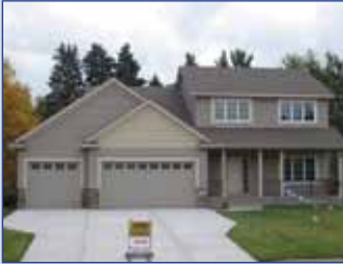
New house available at 5722 Oregon Ct